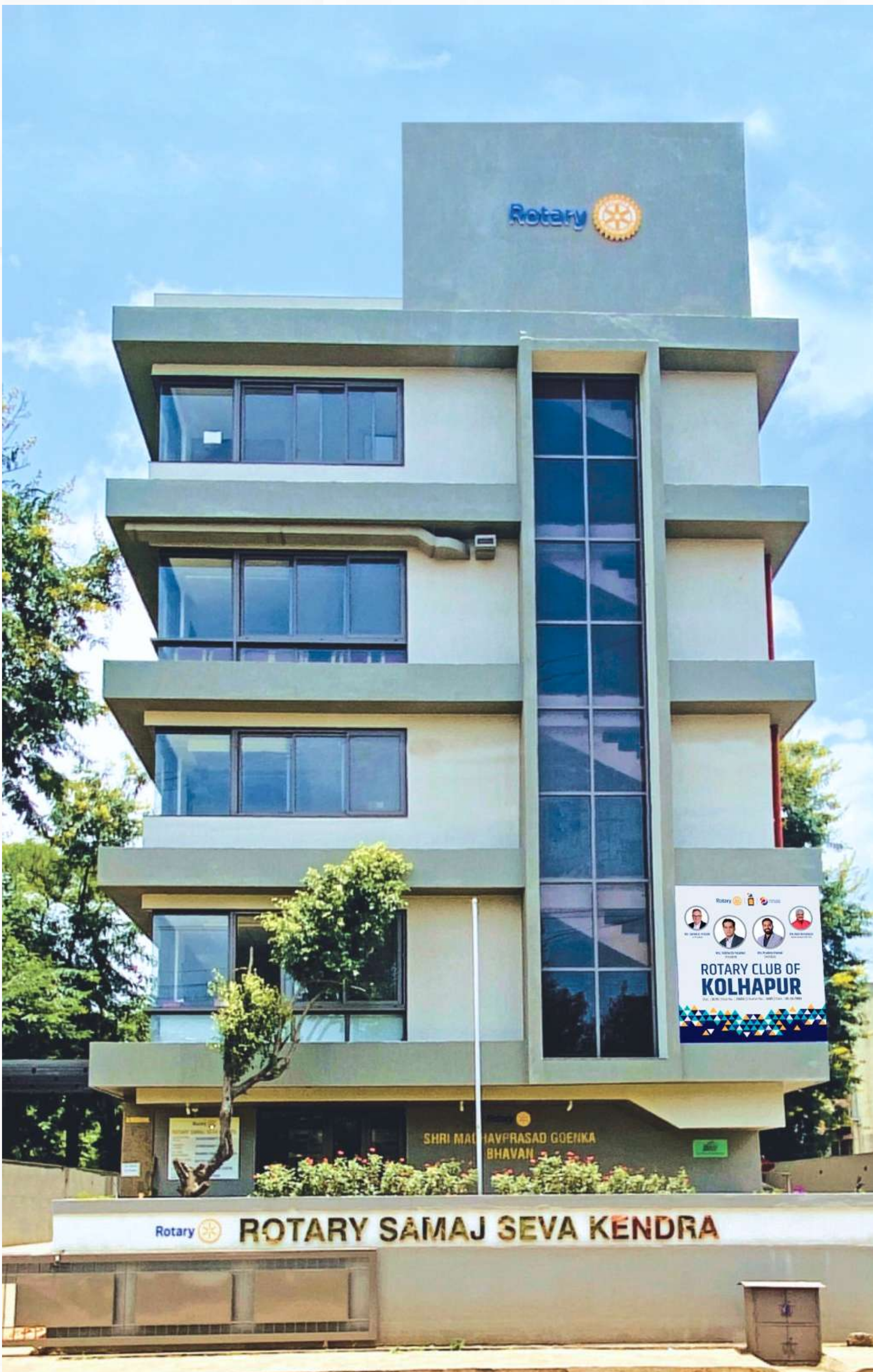
ROTARY CLUB OF KOLHAPUR'S ROTARY SAMAJ SEVA KENDRA BUILDING

Our club will be holding the award ceremony on Wednesday, 6th September 2023 and request our Club members to suggest suitable teachers in various government or government aided schools for this award. The deadline for considering applications is till 15th August.